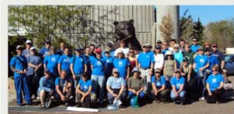
URS' "Employee Volunteer Program" volunteers at the Wildlife Sanctuary.