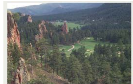
Perry Park Golf Course