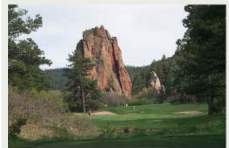
Perry Park Golf Course